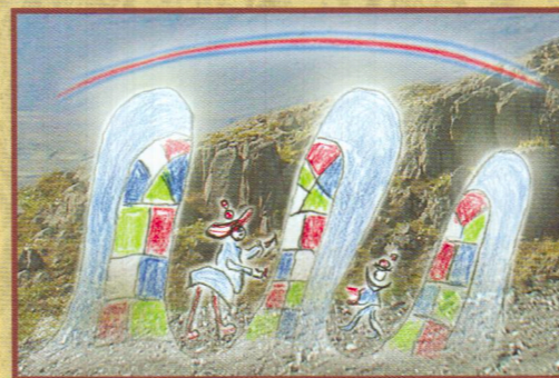
The dwellings of elves in Vaðlaheiði.

By using a technique I have termed the "adventure-eye" one can have a glimpse into the past and the future. The Eyjafjörður area is a great place for travel and there are many sacred places like churches that exist in in the present and past. These are connected by strands of light and they shine like beacons and have their individual stories to tell. Some go back to the year 1000, or even further as many of the Christian places of worship have been built on sacred sites from the pagan past. Some may have been abandoned years ago but their energy still reverberates into the present and there you can experience the residual energy of generations long gone, their joys and sorrows. Through silence we will perceive music and guidance.